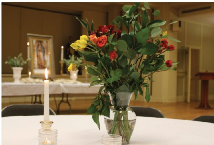
Roses, candles and religious images set a quiet and prayerful tone for a SEEN gathering.

"The name 'SEEN' is important because very often, nobody knows what happened. The parents hold it inside," she explains. "But we're here to affirm the dignity of the life lost. As Catholics, we believe that life begins at conception, and every soul has meaning and purpose."