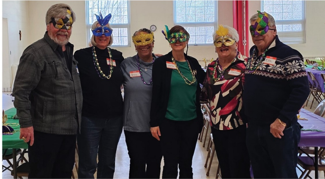
Parishioners from Sacred Heart Parish in Suffield participate in the mask-making activities during last year's Mardi Gras celebration to kick off the Lenten season.

As winter lingers and Lent approaches, Sacred Heart Parish in Suffield is once again inviting parishioners to gather for a joyful celebration that brings the community together before the reflective season begins. On Feb. 15, following the 10:30 a.m. Mass, parishioners are encouraged to head to the church hall for the second annual Mardi Gras celebration—a lively afternoon of food, music and fellowship.