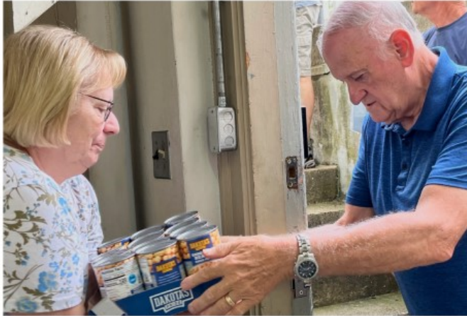
A case of canned food is carried in by volunteers of Mother Teresa Food Pantry which operates from St. Ann Church in Bristol.