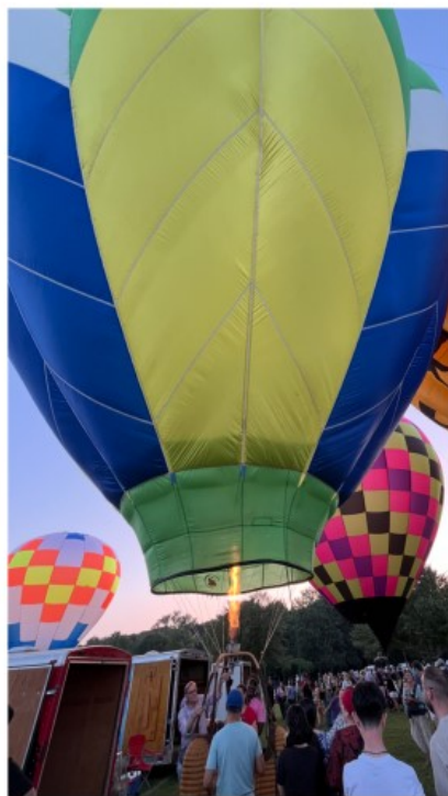
For the second year in a row, Our Lady of Mercy Parish in Plainville will have a booth for evangelization during the upcoming Plainville Fire Company Hot Air Balloon Festival.

Our Lady of Mercy Parish in Plainville is inviting people who have questions about the Catholic Church to ask them during the town's upcoming balloon festival.