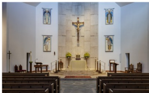
The renovated sanctuary is now smaller, with an elevated altar and tabernacle, plus new fabric tapestries.